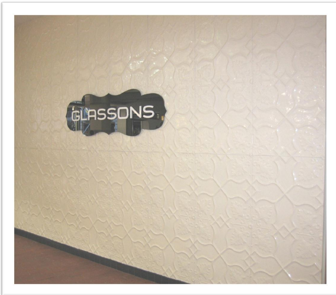
A High Gloss finish has been used on the Shield panel here with great effect.

Power points can be re connected and the covers popped back on.